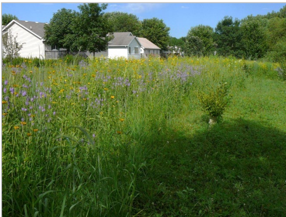
After , north side prairie area (2009)