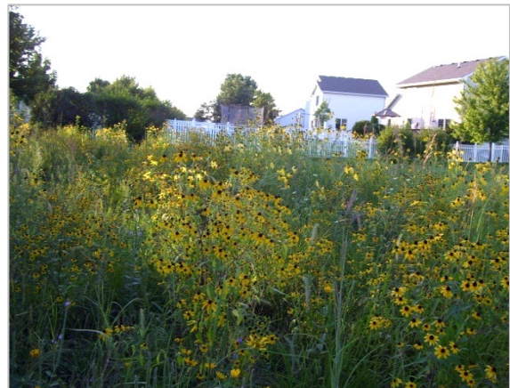
After , north side, prairie area (2009)