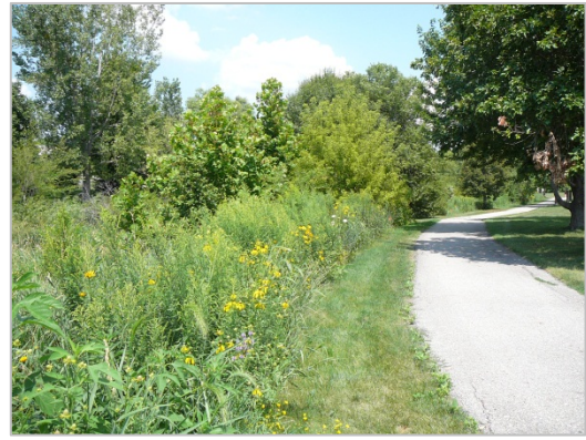
After , south side with stream to left (2012)