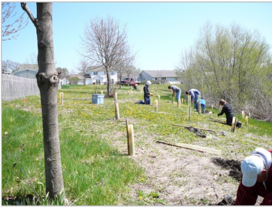
Before , north side of stream (2008)