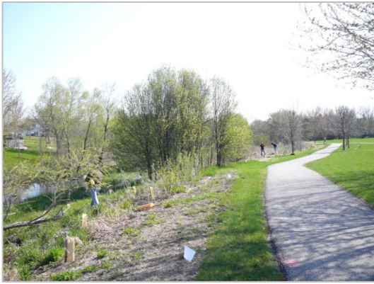
Before , south side of stream visible at left (2007)